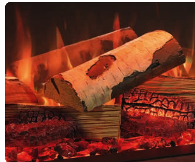
Optional Split Silver Birch Log-effect