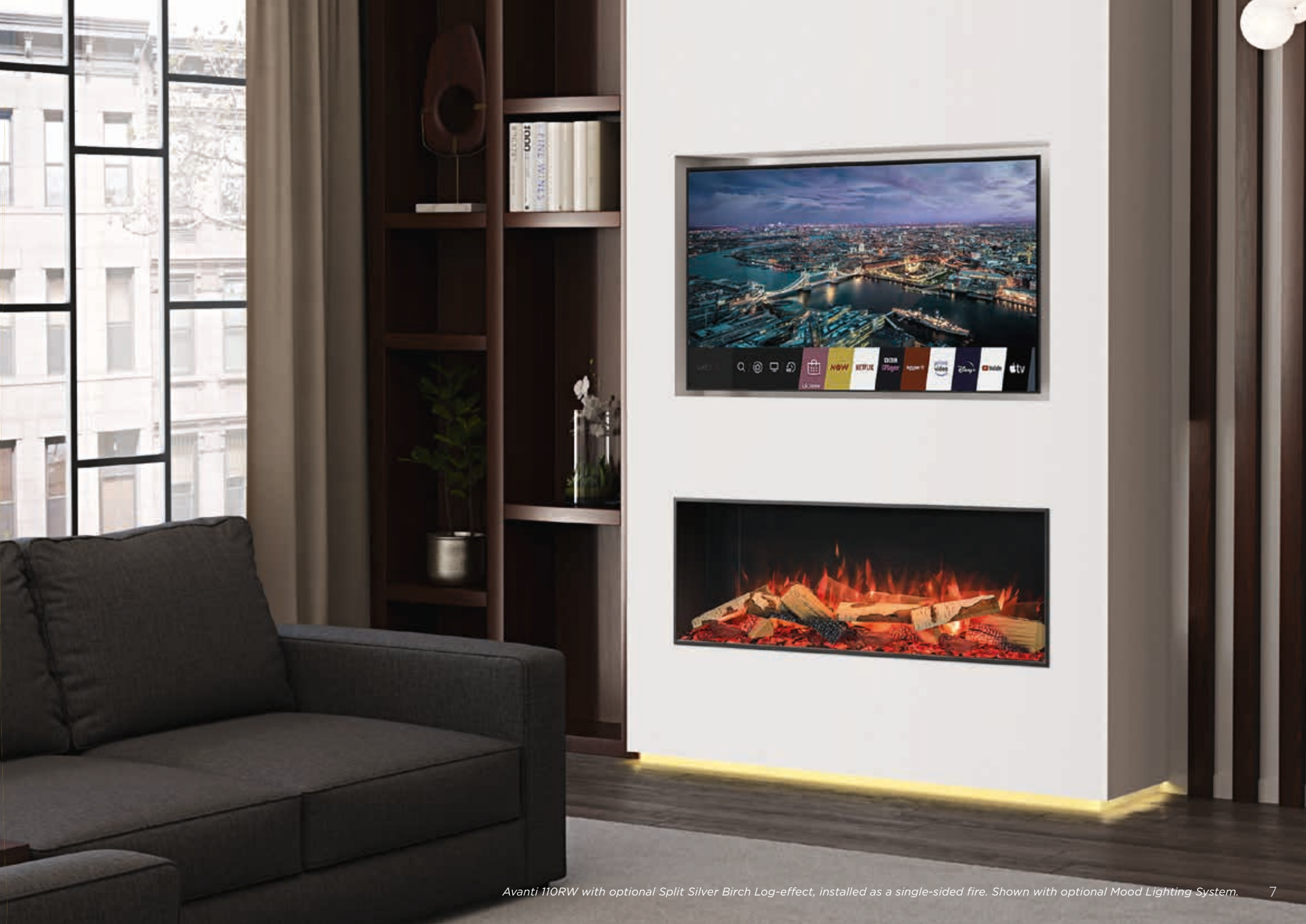
Avanti 110RW with optional Split Silver Birch Log-effect, installed as a single-sided fire. Shown with optional Mood Lighting System.