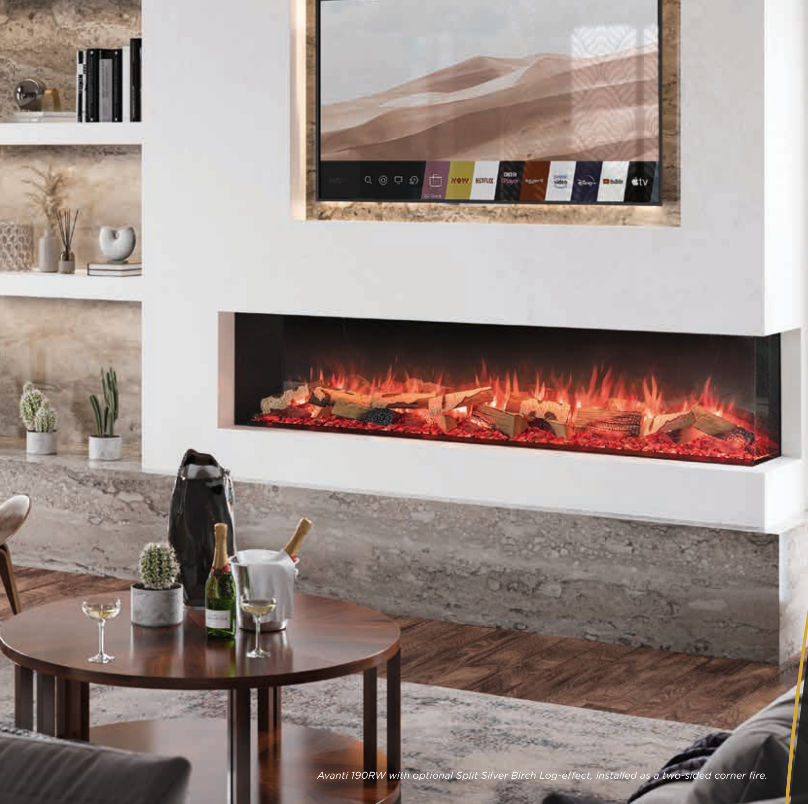
Avanti 190RW with optional Split Silver Birch Log-effect, installed as a two-sided corner fire.