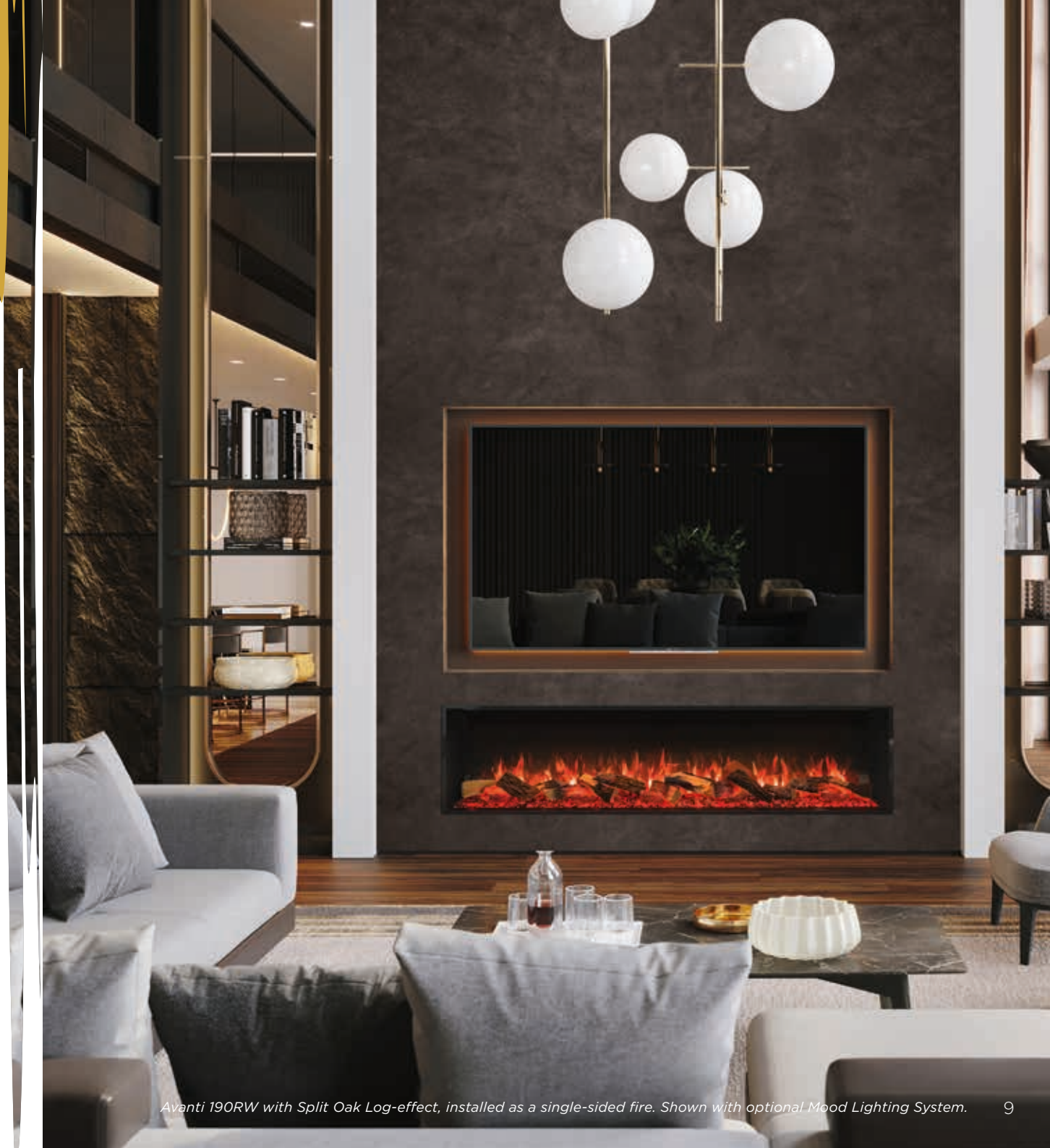
Avanti 190RW with Split Oak Log-effect, installed as a single-sided fire. Shown with optional Mood Lighting System.

See pages 3, 5 & back cover for additional images