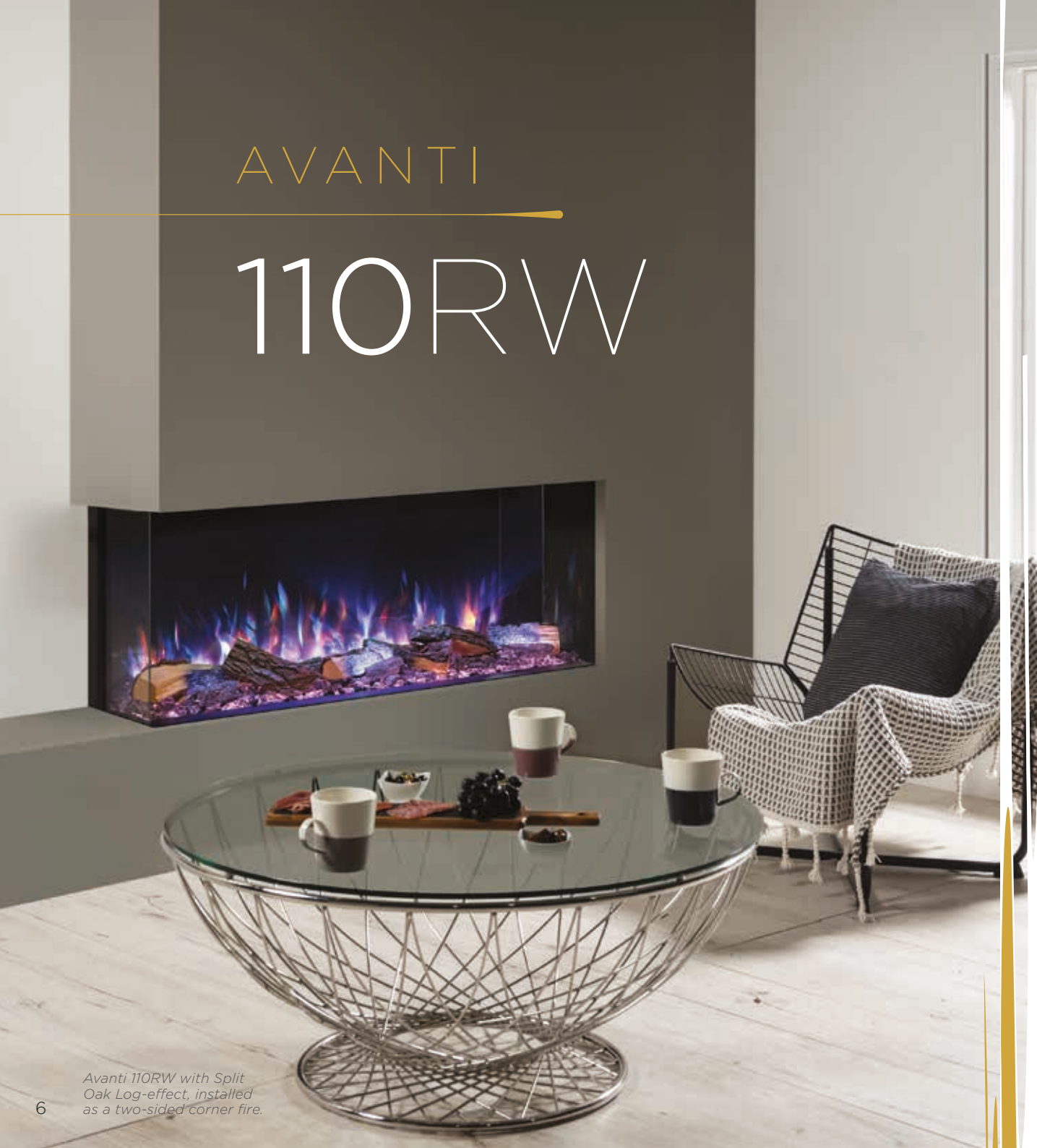
Avanti 110RW with Split Oak Log-effect, installed as a two-sided corner fire.